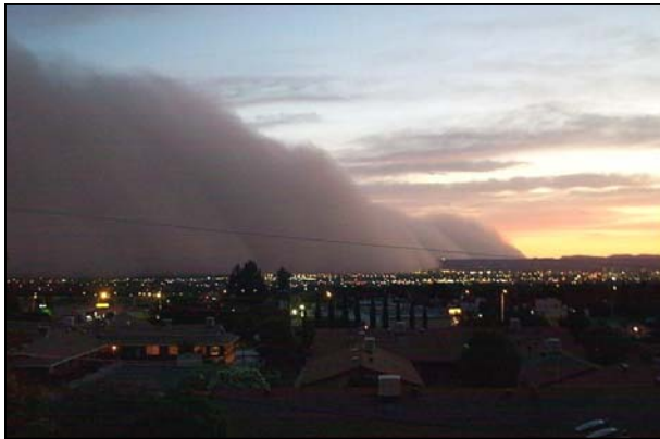
Dust storm across Las Cruces May 2004